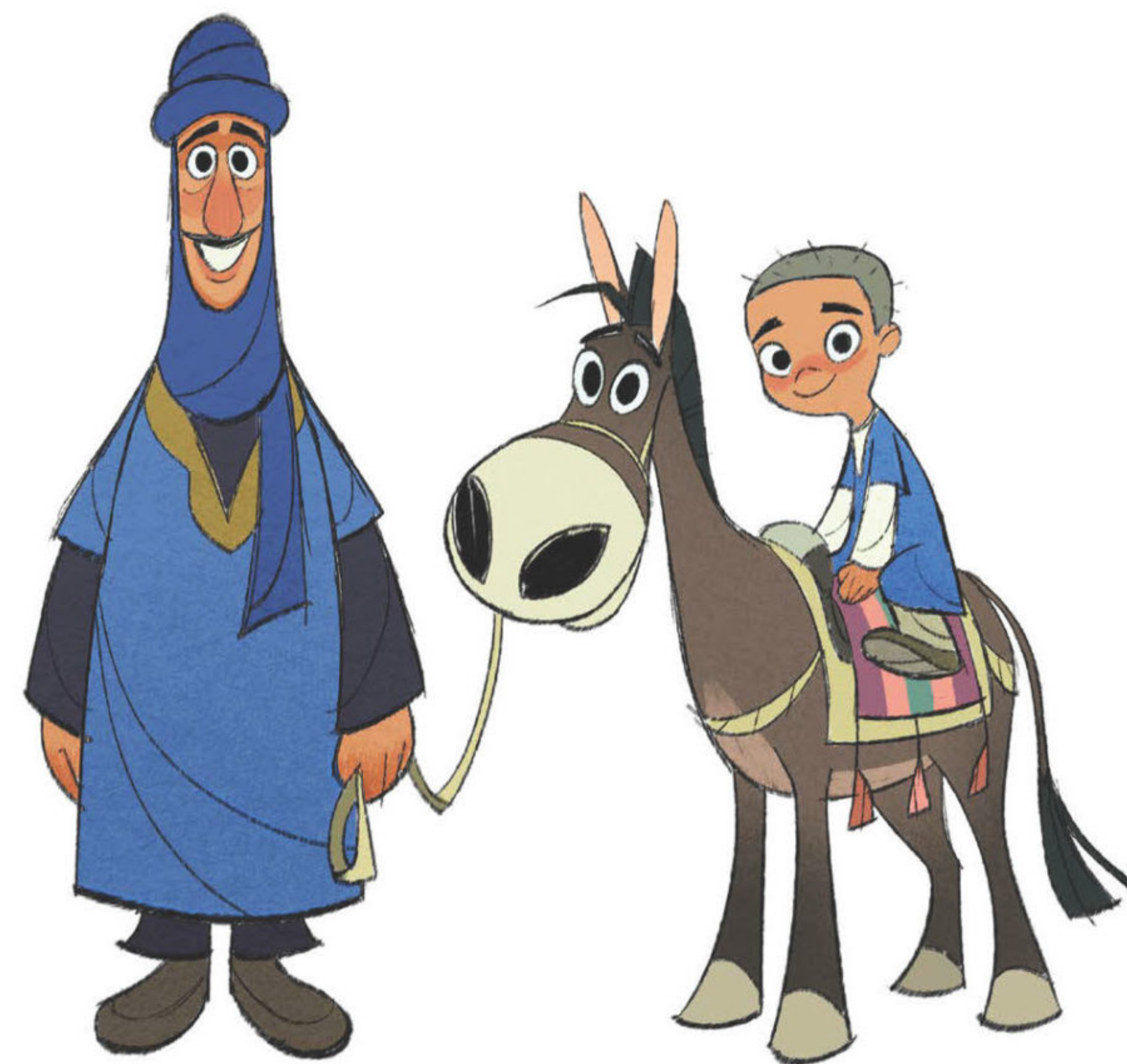
Illustration by Ben Tong